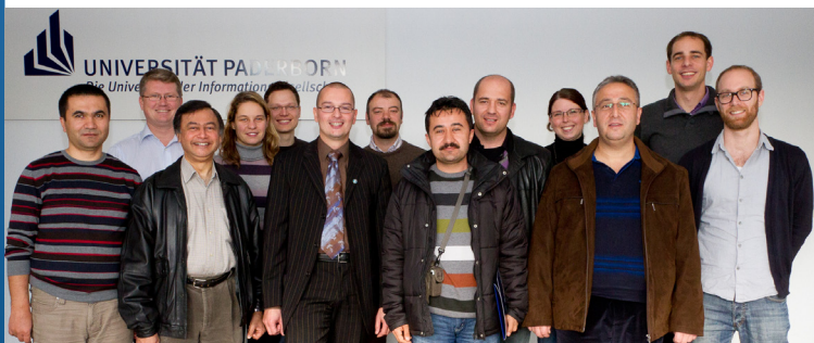
participants of the 1st workshop in Paderborn, Germany